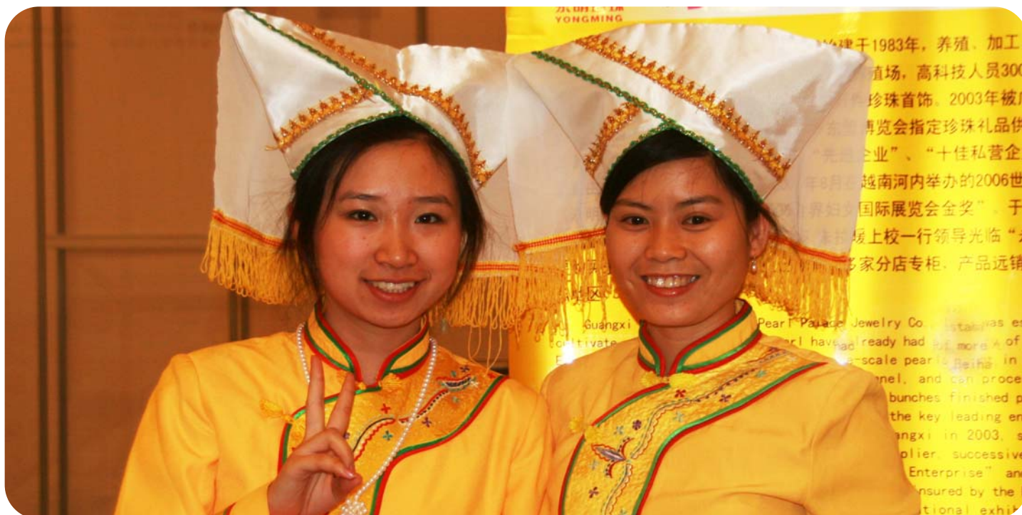
Two Zhuang girls from Guang Xi Province, selling pearl products on the first floor of the BICC.

The qualification battle is hotting up with 12 rounds gone and just five to play. Poland reclaimed top spot in the Under 28 series on 238 VPs, 16 clear of second-placed Belgium on 222. They in turn are closely followed by China on 216, Israel 215 and England 214.